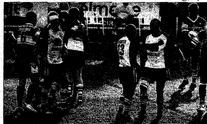
Narrabeen celebrate after defeating Narraweena at Brookvale on Sunday.

Fortune played no part in the preliminary final, with